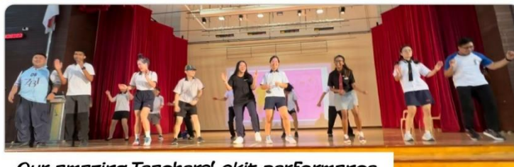
Our amazing Teachers' skit performance