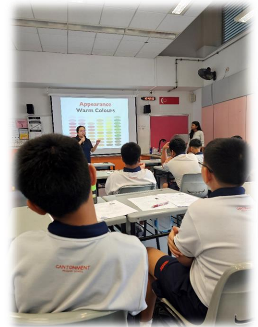
Personal Grooming, Social and Fine Dining Etiquette Workshop