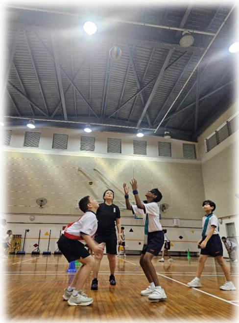
P6 Games Day