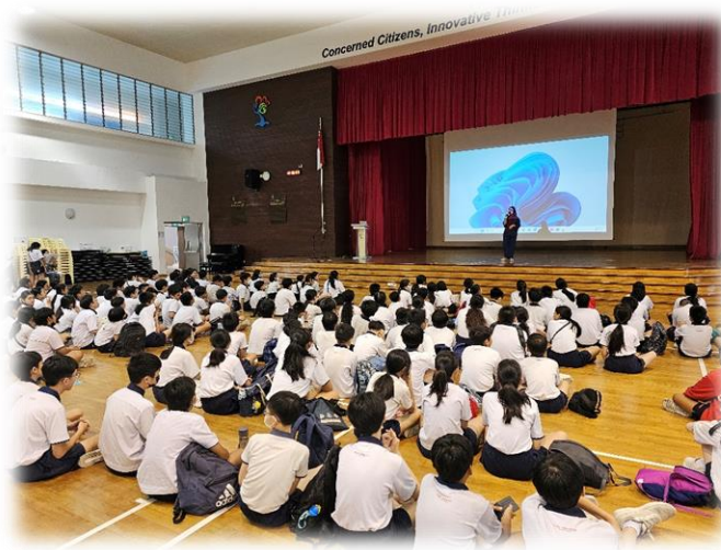
Secondary School Talks