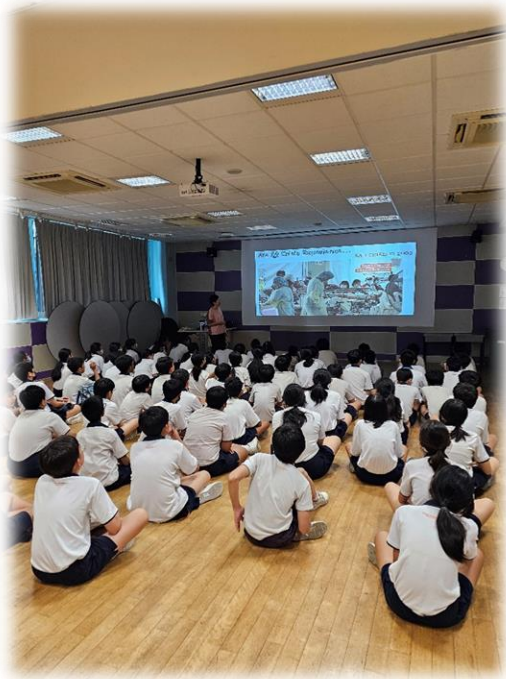
Career Guidance Sharing