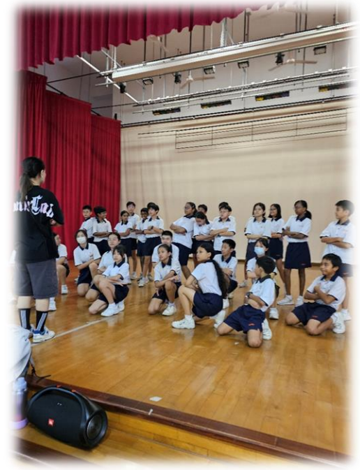
PAVE LLP Dance