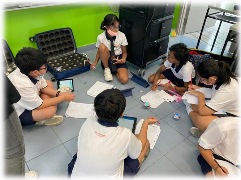
Code For Fun