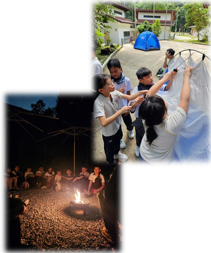
Outdoor Adventure Camp