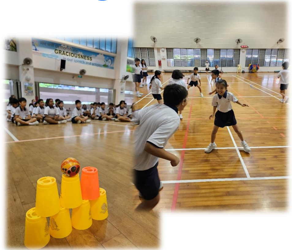
Cultural Bonding Day